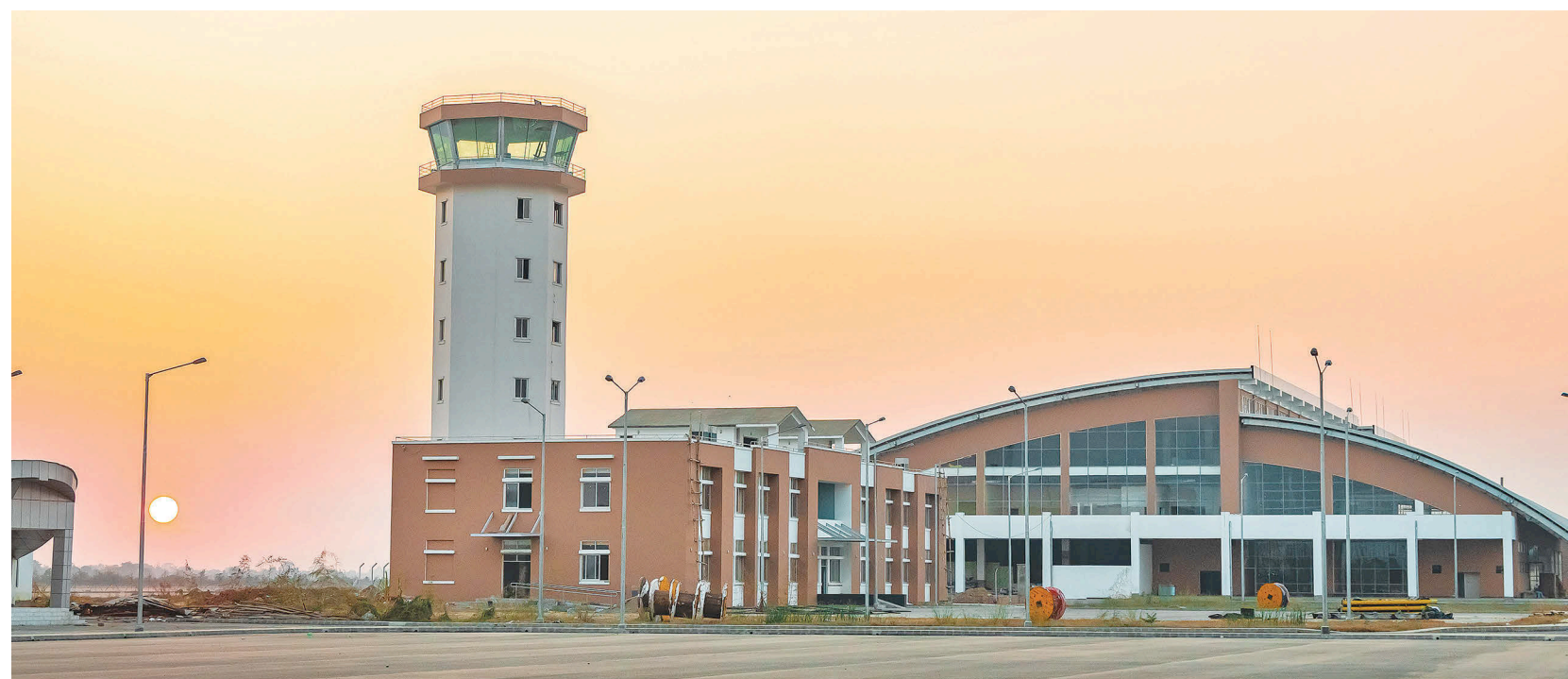
Gautam Buddha International Airport in Bhairahawa in south central Nepal is the gateway to the international pilgrimage destination of Lumbini, the birthplace of Gautam Buddha.

Airport and flight inspections have to be conducted every year, but Nepal has not been able to conduct the tests for the last two years due to Covid-19.